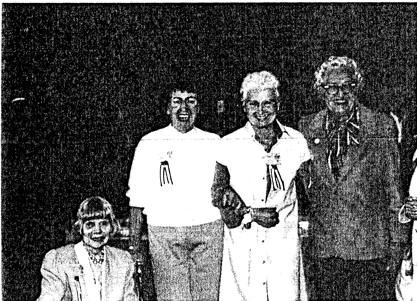
1936 Olympic Gold Medalists, 400 Meter Relay, L-R: Harriet C Bland Green; Annette Rogers Kelly; Elizabeth Robinson Schwartz; Helen Stephens.